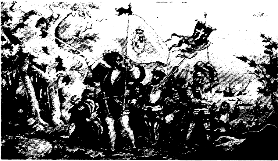
Flags first planted on the shores of the New World by Christopher Columbus are shown in this sketch of the historic landing in 1492. The friendly Indians are shown behind the trees as they approach to greet the seafaring Spaniards, who treated them brutally later.