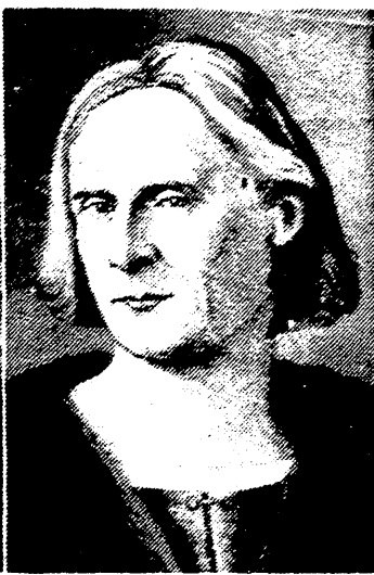
This is one of more than five hundred portraits of Columbus that have been made.